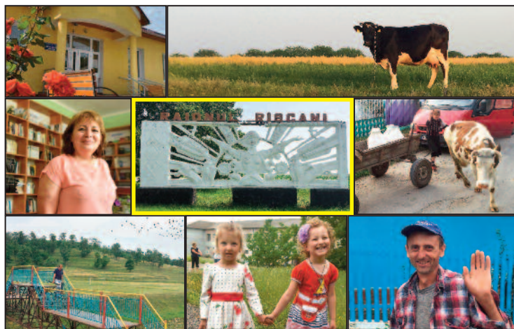
1st Row: Medical clinic, and a cow in Mihaileni. 2nd Row: The library in Mihaileni, the Rîșcani sign near Ciubara, and a runaway cow in Vasileuți. 3rd Row: A bridge to the soccer field in Borosenii Noi, girls at a kindergarten in Moșeni, and a friend in Vasileuți.