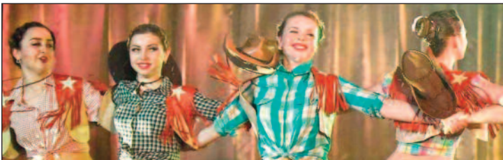
Students dance to "Cotton Eye Joe," an American folk song.