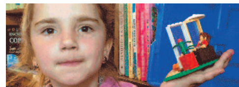
Children can learn to create with Lego blocks at the Children Library in Rîșcani, thanks to a grant from Novateca.

"Give a man a fish, and you feed him for a day. Teach him to fish, and you feed him for life." Proverb