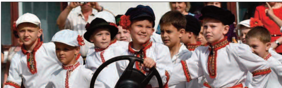
Children perform a traditional dance for Last Bell at the Russian School in Rîșcani. Last Bell is celebrated at the beginning of the last day of school.

When I am finished (in a few months,) the raion will have thousands of photographs from all around Rîșcani, that can be used by the council, the villages, businesses or the people, for marketing, tourism, grants, programs or projects. Click Here