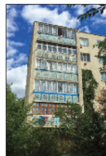
A decorated part of my apartment building in Rîșcani.