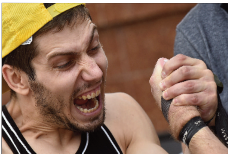
I photographed my first arm-wrestling competition, (for both men and women,) this month. What a show! Click here for photographs