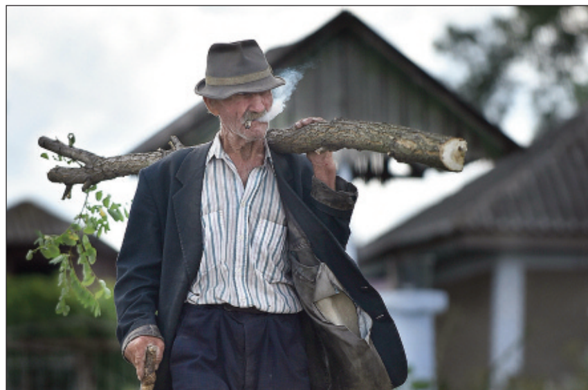
One image in the Imagini Rîșcani project displays the strength, determination and work ethic of the Moldovan people.