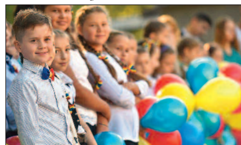
At the Liviu Damian school.

Those are very special days, as the students dress up in beautiful clothes, bring flowers for their teachers, and assemble early in the morning for a celebration of education, with song, dance, and... announcements!