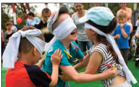
Children play during opening of an accessible playground at the Phoenix Centre.

The modern facility is handicap-accessible, with an