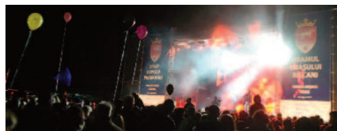
Happy Birthday Rîșcani! Photos: Click

Most cities and villages in Moldova celebrate one day each year as their “Hram” or church day, or often celebrated as their birthday. In Rîșcani, Sept. 21 started with bicycle races, and then a motorcycle show, and it all ended with a concert and fireworks.