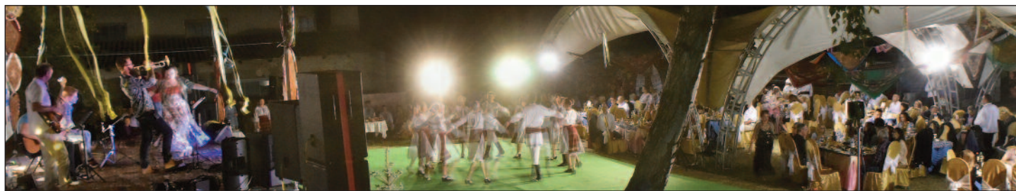
The Phoenix Centre in Rîșcani celebrates and raises money to continue helping children with disabilities.