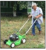
This is the only gas lawnmower I have seen in Moldova.

"We did not inherit this earth from our parents, we are borrowing it from our children." Anonymous