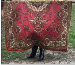
Moldovans who clean rugs by hand save electricity used by millions of vacuum cleaners.

This is all the cost of technological progress, and the U.S. is far ahead of many countries in both good and bad ways. But, Moldova is catching up, and it is hoped that Moldovans will study what is done wrong and right in other countries, learn from other's mistakes and keep their home beautiful.