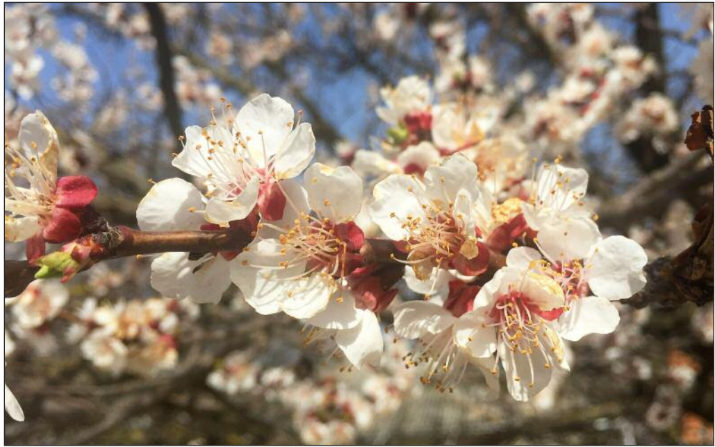
Tree blossoms in Rîșcani in the spring. The reward for enduring another long, Moldovan winter is to be greeted by the beautiful flowers and emerging life all around us.