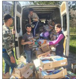
Volunteers load nearly a ton of paper onto a van for recycling at Gheorge Rîșcanu Middle School.

Plastic bottles are stored in metal cages outside each school. Bins for collecting paper, and materials for the cages were provided by a Let Girls Learn grant through the U.S. Peace Corps. Students in the Professional School of Rîșcani welding classes built the cages.