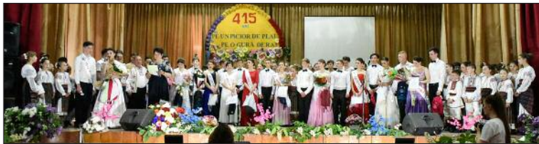
Above, performers of Mostenitorii (The Heirs) on stage after the finale of their spring program. Right, with a soldier standing guard, a woman places flowers on the monument in Rîșcani's war memorial park after a service commemorating the anniversary of Germany's surrender in World War II.