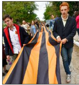
The Russian military's St. George's ribbon.

The treaty was signed on May 7 and called for surrender on May 8, which is celebrated in Europe as "Europe Day." But