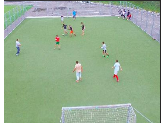
Playing soccer at the stadium in Rîșcani.

Happy Birthday to You, Happy Birthday to You, Happy Birthday dear (Name), Happy Birthday to You! ( Fericit naștere zi pentru tine, Fericit naștere zi pentru tine, Fericit naștere zi, dragu (Name) Fericit naștere zi pentru tine! )