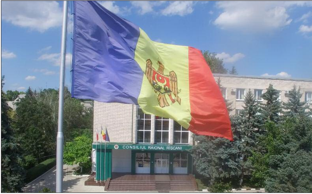
The Moldovan national flag in front of the Rîșcani district offices in the city of Rîșcani.