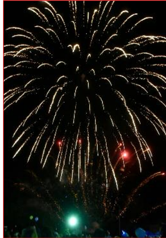
Fireworks above Rîșcani for the city's birthday party on September 21, 2016.

People in both countries fly their flags at half-mast when in mourning. In America, government buildings usually fly the flag of their state along-